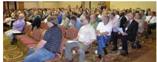
Some of the 440 in attendance.

Based on a quick review of the evaluations, it was simply an outstanding Conference, and as always, a great opportunity to strengthen the partnership between the consulting community and ODOT.