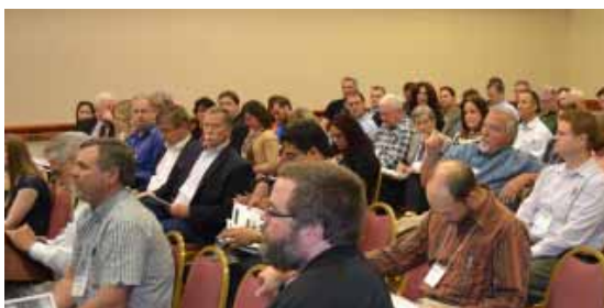
Great participation during breakout sessions

Our thanks to everyone who attended for making this a great Conference, and we look forward to the 13th Annual Partnering Conference scheduled for April 24, 2014 in Tulsa.