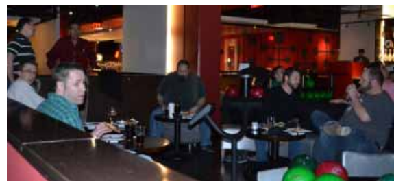
Members of the Leadership For Engineers Class of 2012 relax during an evening of food, fun, and bowling following a long day of classwork.