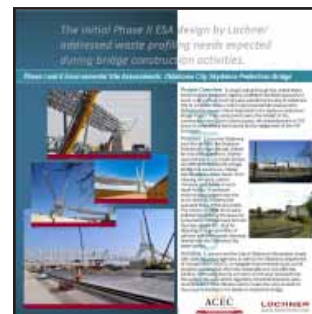
H.W. Lochner Phase I & II Environmental Site Assessment Skydance Pedestrian Bridge