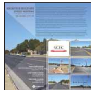
Crafton Tull MacArthur Boulevard Widening

The Falls Creek Baptist Conference Center had outgrown their water treatment facilities. Operated by the Baptist General Convention of Oklahoma (BGCO), they needed water infrastructure planning,