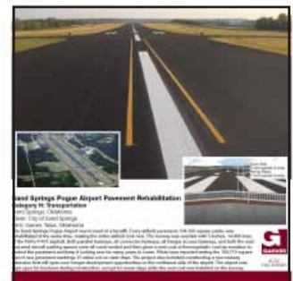
Garver Sand Springs Pogue Airport Pavement Rehabilitation